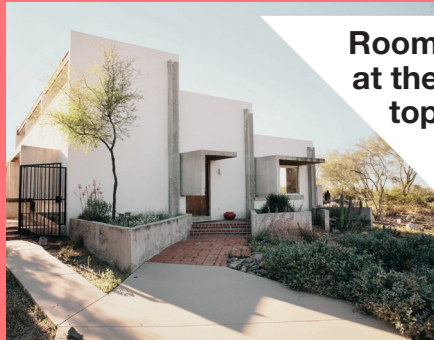
Room at the top